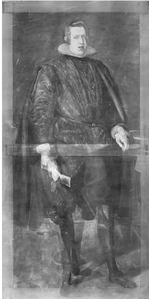
LEFT: Diego Rodríguez de Silva y Velázquez (Spanish, 1599-1660), Philip IV, 1623-27. Oil on canvas. Museo Nacional del Prado, Madrid. RIGHT: X-radiograph of Diego Velázquez's Philip IV, 1623-27, showing evidence of the underlying c. 1623-24 image. Museo Nacional del Prado, Madrid.

This official portrait of Philip IV will be accompanied by four other portraits by the Spanish master that belong to American collections: Portrait of King Philip IV (1623-24) from the Meadows Museum; Portrait of Luis de Góngora y Argote (1622) from the Museum of Fine Arts, Boston; Portrait of the Jester Calabazas (c. 1631-32) from The Cleveland Museum of Art; and Portrait of Don Pedro de Barberana (c. 1631-33) from the Kimbell Art Museum in Fort Worth. This Prado-Meadows initiative will be the first time