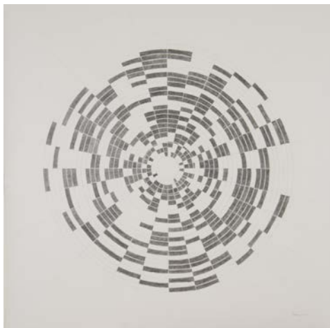
January 2013, 2013, Graphite on Paper