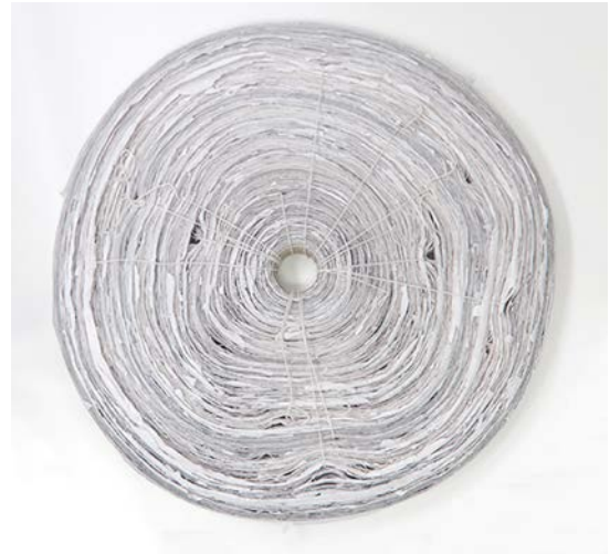
2,490, 2012. Paper, tape, string