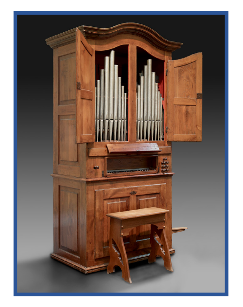
Pascoali Caetano Oldovini, Organ , c. 1762. Chestnut wood case, boxwood and ebony keys, tin, and organ metal, 101 3/4 x 55 x 31 in. (259.7 x 125.7 x 71.8 cm). Meadows Museum, SMU, Dallas. Gift of The Meadows Foundation, MM.83.05.

Manuel Álvarez Bravo, Stretched Light , c. 1977. Gelatin silver print on paper, 10 x 8 in. (25.4 x 20.3 cm). Meadows Museum, SMU, Dallas. Gift of W. Barton Munro, MM.88.05.04.